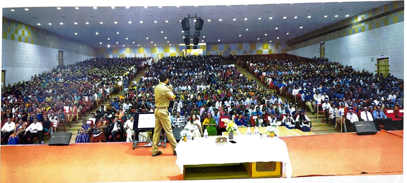
The Guinness Oration